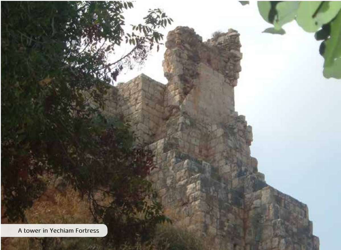
A tower in Yechiam Fortress

The city’s history revealed in the most amazing and historical anecdotes; for example the origin of the Paratriskaidekaphobia (fear of Friday the 13th) and Triskaidekaphobia (fear of number 13).