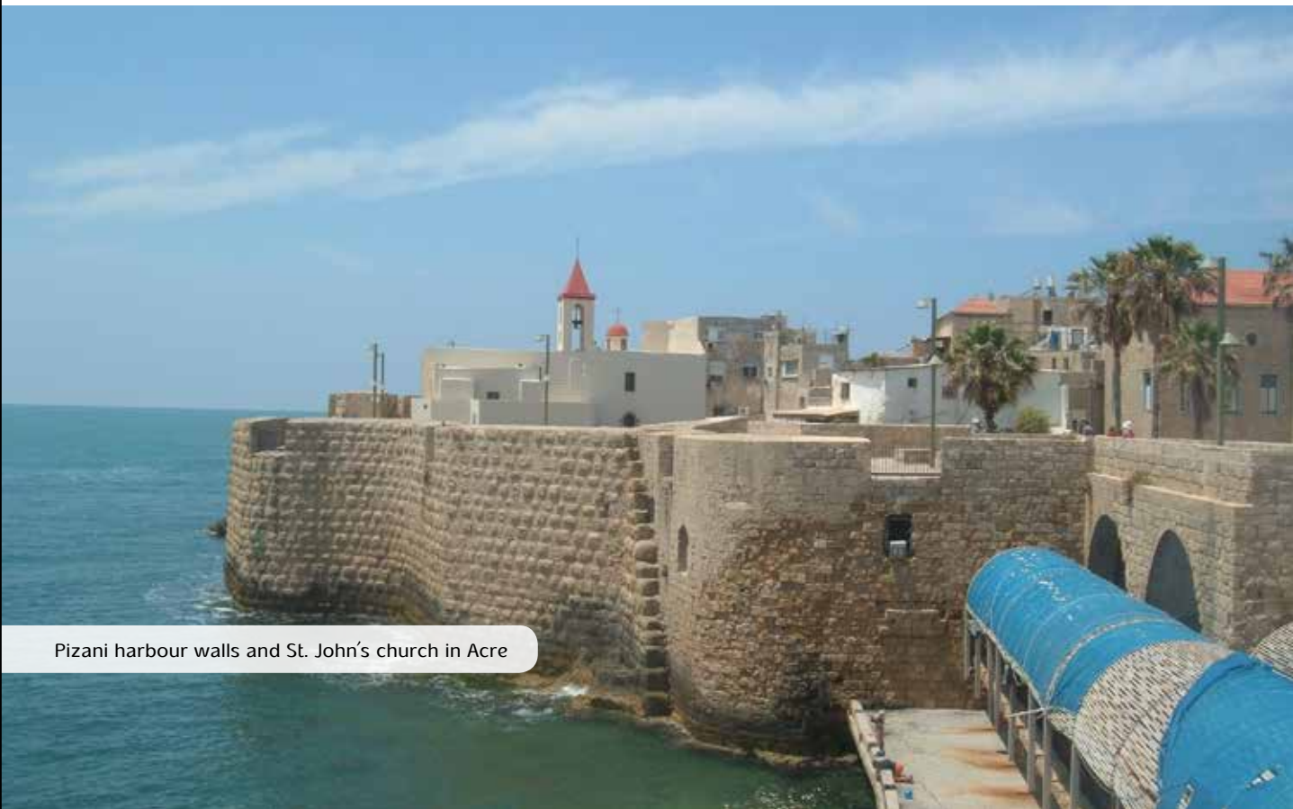
Pizani harbour walls and St. John's church in Acre