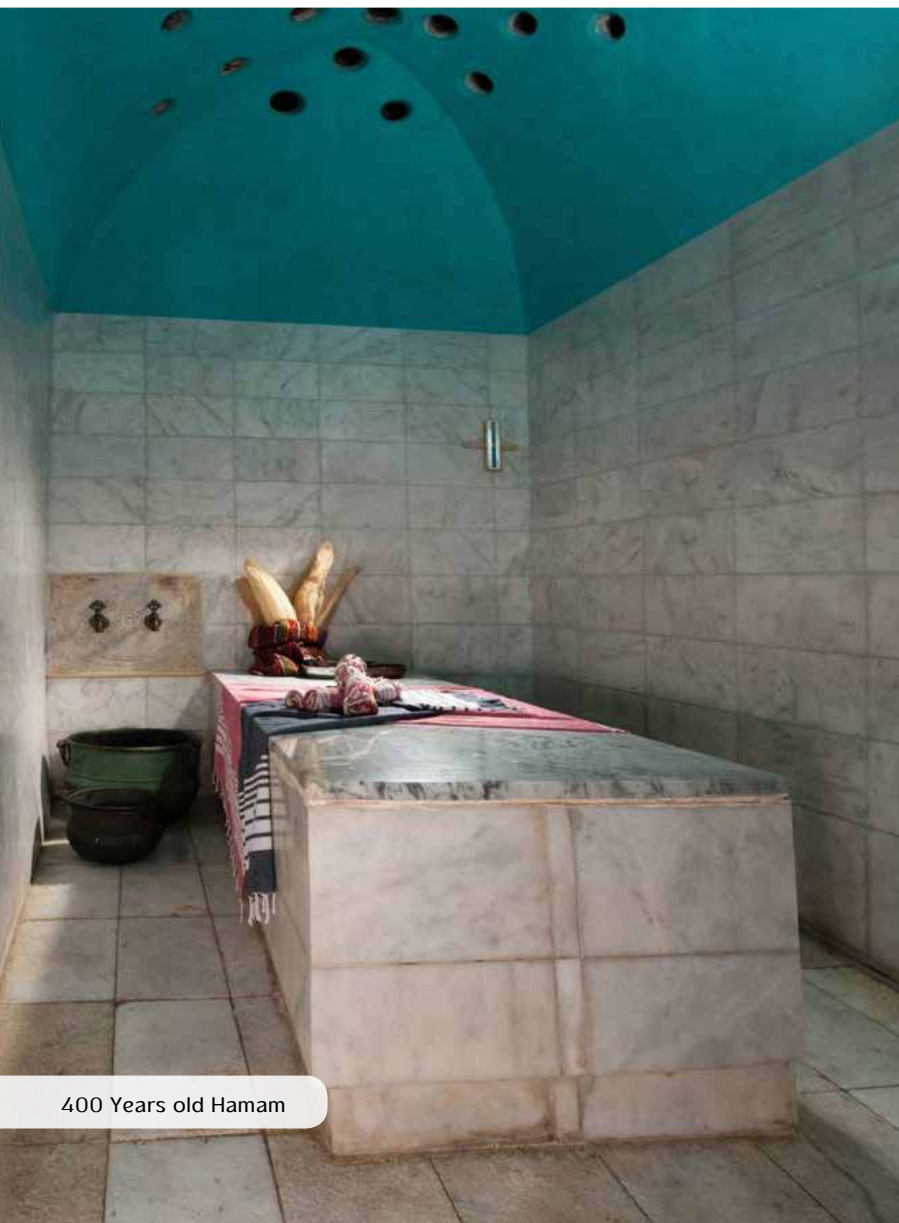
400 Years old Hamam