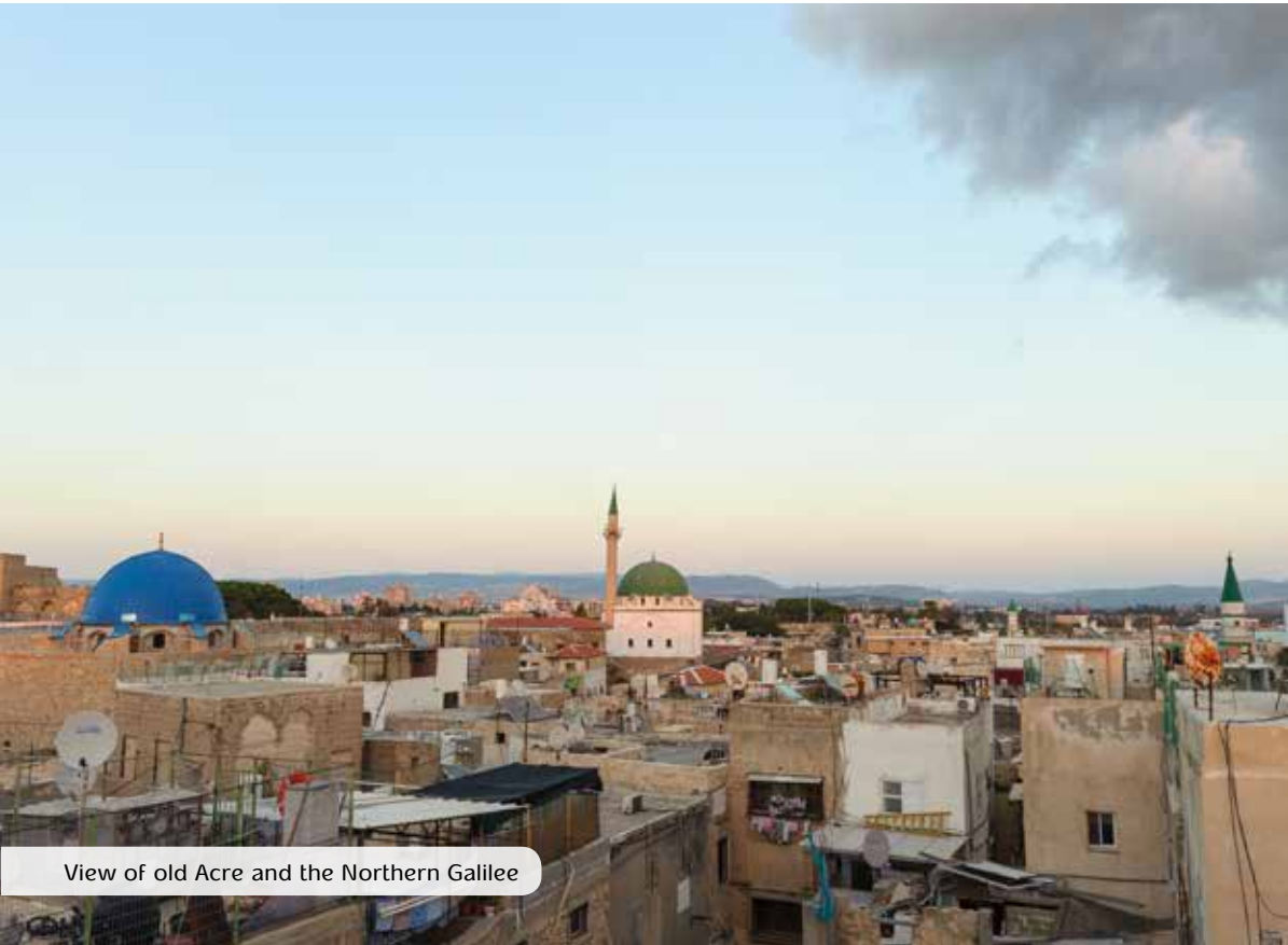
View of old Acre and the Northern Galilee

Here are some more details regarding our activities: