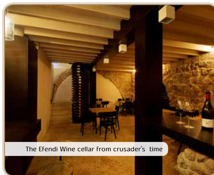
The Efendi Wine cellar from crusader's time

Fresh fish grilled & planche Massage & alternative treatments Shopping at the market Buying and handling fish & seafood Grand tour of the Efendi Hotel (1500 years of history, archaeology) and conservation