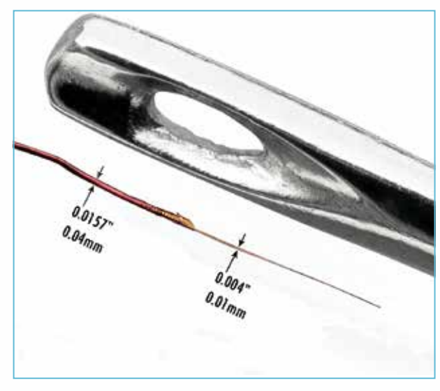
A serially-manufactured soldering-free connection of a 9 micron (59 AWG) wire to a 40 Micron (46 AWG) wire. Manufactured by Benatav.